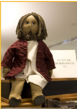
MINISTRY RESOURCE CENTER: YALE DIVINITY SCHOOL