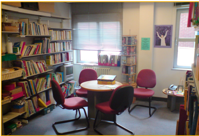
MINISTRY RESOURCE CENTRE: DIOCESE OF LONDON, UK