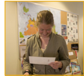
LEFT: THE LIGHTHOUSE CHRISTIAN MINISTRY RESOURCE CENTER, ORMOC CITY, PHILIPPINES